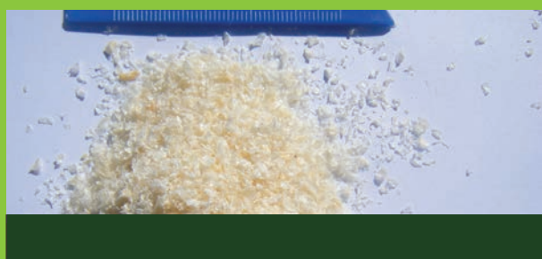
Milled crayfish shells (above right) and chitosan (above)

salt load. A British Council Africa Knowledge Transfer Partnership sponsored project is seeking to improve the poor groundwater quality on the arid West Coast, at Garies in the Kamiesberg municipality (Northern Province). If successful, this will have a significant impact on the local community, whose development is severely